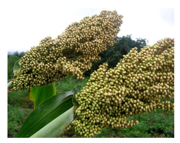
Compact panicles of urine fertilised sorghum

To investigate the nutrient efficiency of urine in comparison with mineral fertiliser and compost and to estimate the value of cereal fertilisation under local conditions.