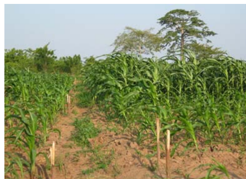
Rain fed trial - right urine treatment