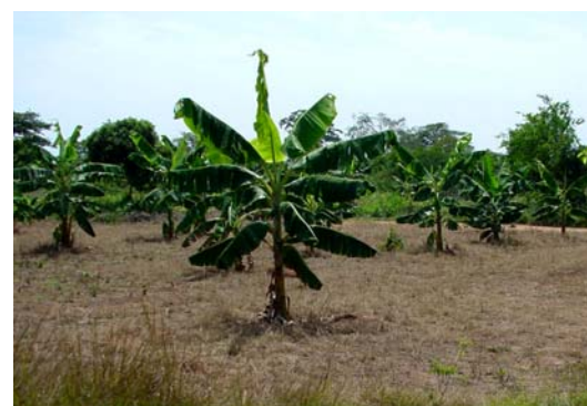
Greywater irrigated plantain