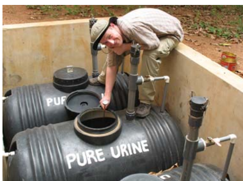
Urine collection tanks