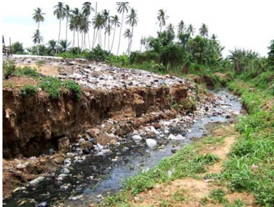
Creek heavily polluted with human excreta and refuse (Nsawam - Ghana)