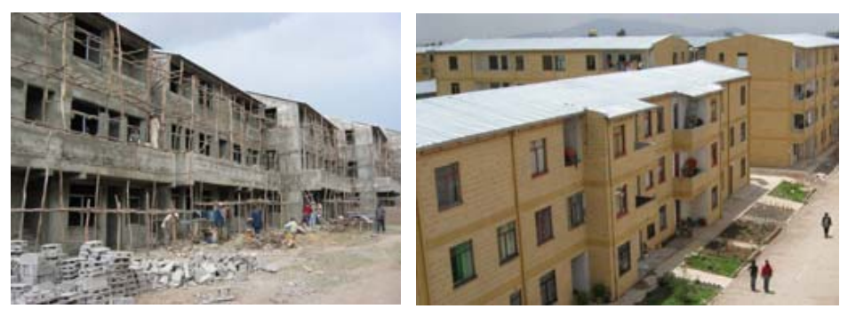
Multi-storey condominium houses during construction and after finishing

The Ethiopian government is currently pursuing large housing programmes to address the constant population growth and migration to cities. The multi-storey houses regularly face problems with regard to water supply and sanitation. Therefore, urine-diverting dry toilets were adapted for the use in multi-storey buildings.