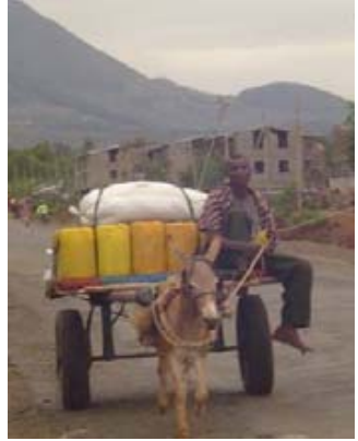
Transport of urine and faeces

A cost analysis showed that investment costs are comparable to the implementation of septic tank systems. Operation and maintenance can be done in an adapted and cost-efficient way. Replacing mineral fertiliser by urine can result in additional monetary benefits particularly in the light of rising fertiliser prices.