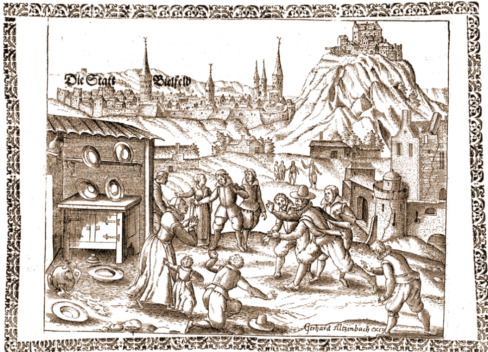
Historical representation of earthquake impacts in Bielefeld 1612 (Alzenbach, 1612)