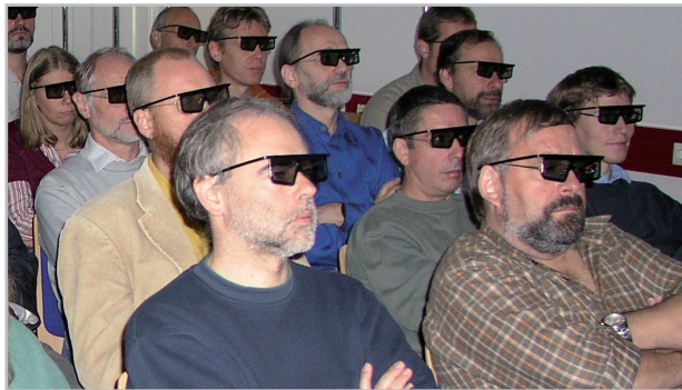
3D presentation in the media room of the BGR

Things have become easier though for scientists in recent years: three-dimensional geological models enable them to delve virtually into the earth's crust. The models graphically present and evaluate the data collected during geological exploration. The models can help scientists cut open a mineral deposit for instance at any position as well as to generate virtual boreholes.