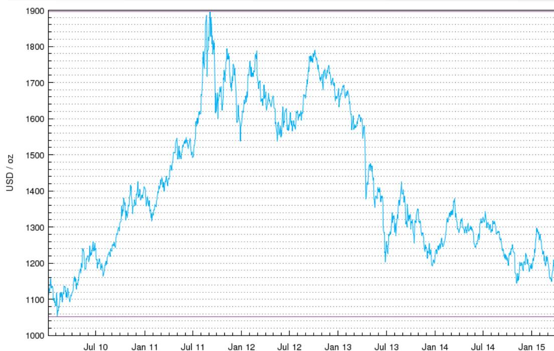
Figure 3: LBMA gold prices from January 2010 to April 2015, USD/oz.