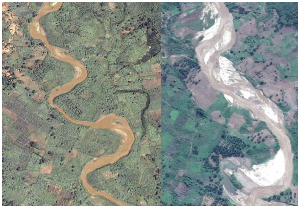
Figure 2: satellite photograph of Kaburantwa river in northern Burundi showing expansion of illegal ASM gold mining activities along the river bed between 2005 (left) to 2009 (right).

river Kaburantwa, the first taken in 2005 and the second in 2009. This is just one of the many examples that can be found on Google Earth.