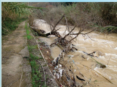
Polluted surface water can intrude into Jeita-Dbayeh canal.