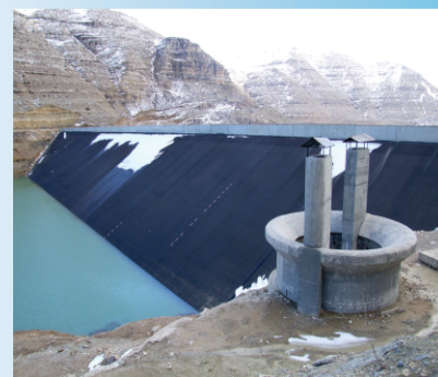
Chabrouh dam supplies Keserwan and Metn.