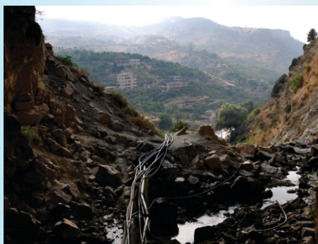
Illegal tapping at Afqa spring.