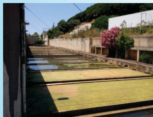
Rapid sand filter at Dbayeh: frequent back washing is needed to prevent clogging.