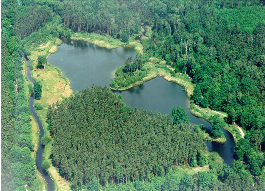
Water supply at Berlin: aerial photo