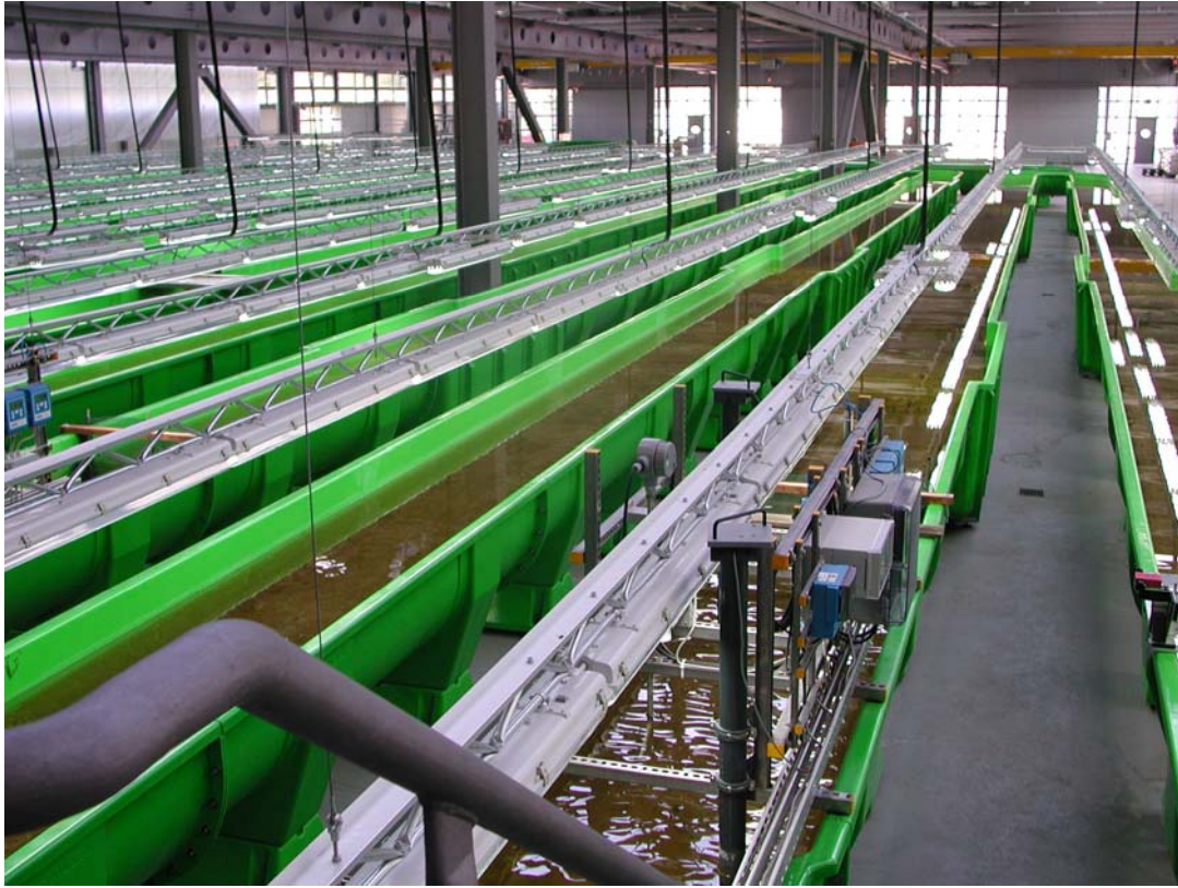
The UBA Experimental Site: biological water treatment

Wasseroberfläche / surface area (pond): 3294 m 2