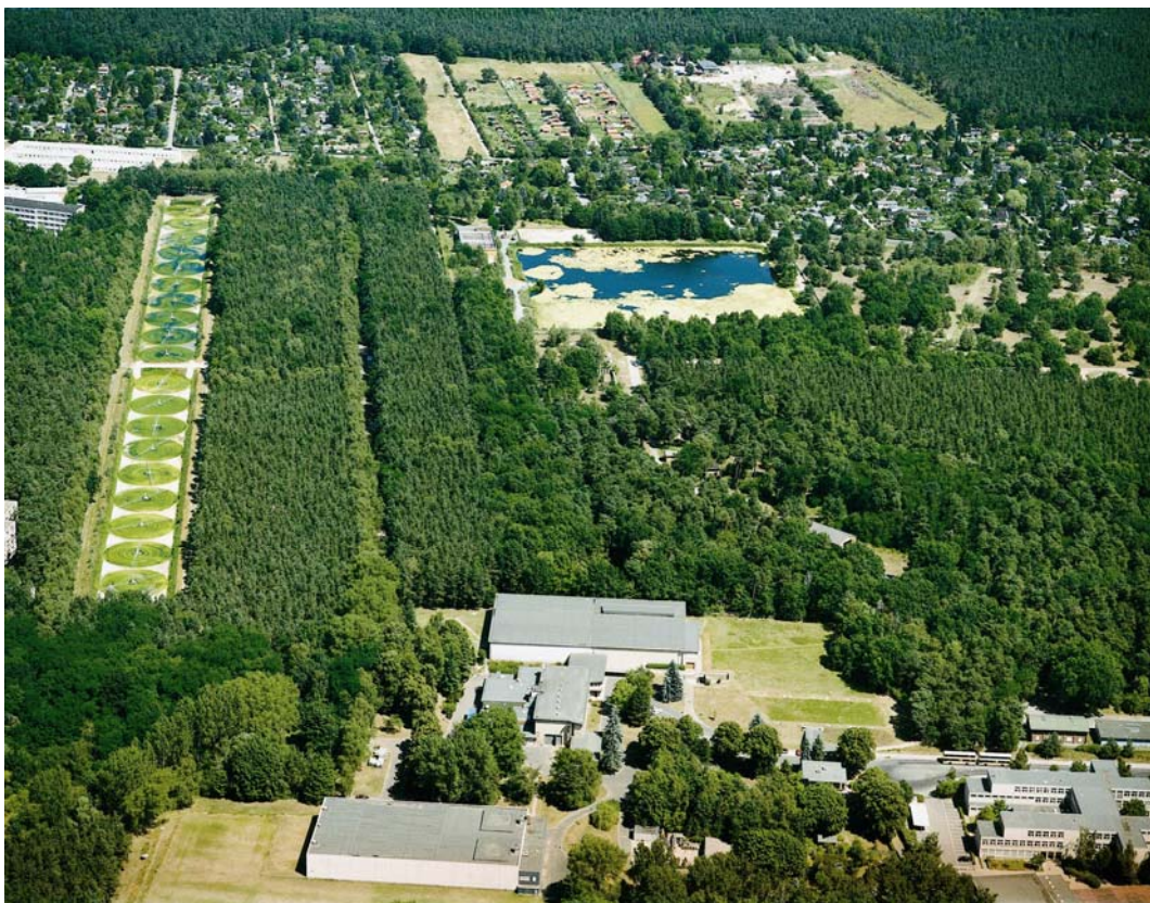
Water supply at Berlin: aerial photo