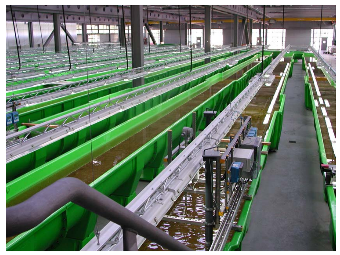
The UBA Experimental Site: biological water treatment