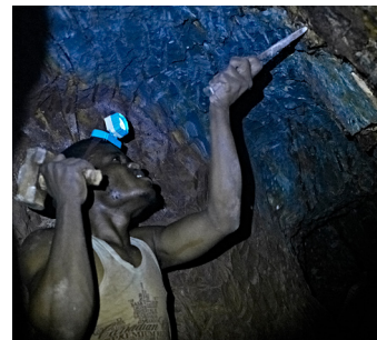
Artisanal Miner in Kampene, Maniema Province

Through these contributions, the project ultimately aims at improving the livelihood perspectives for artisanal miners and local communities living around mine sites.