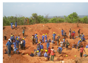
Cooperative CDMC, Tantal Mine, Mayi Baridi, Tanganyika Province